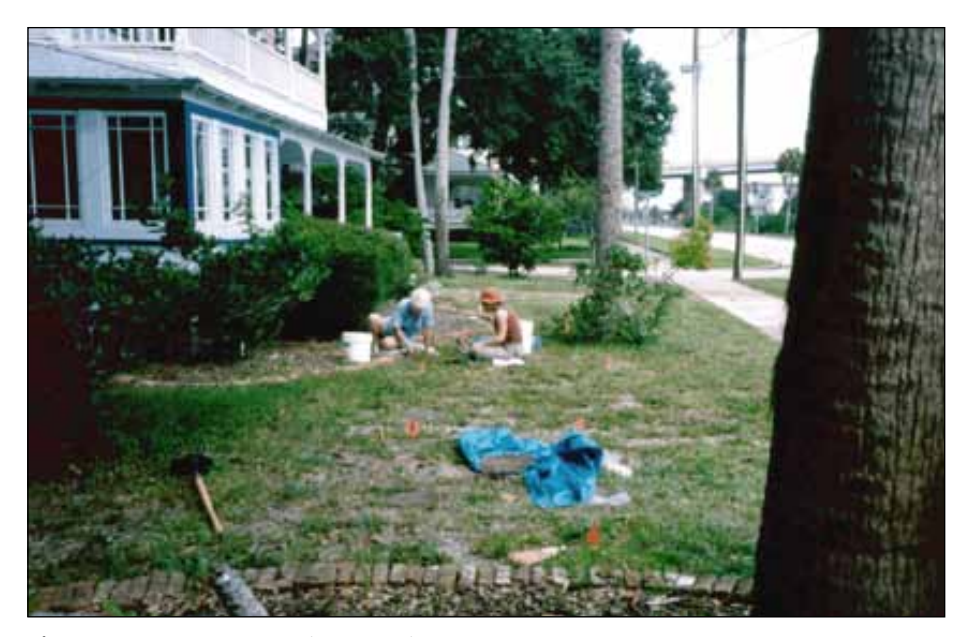
Fig. 5: Survey test excavation on private property.

ings and through journal articles (Grange, 1997; 1998; 1999; Moore and Ste. Claire, 1999). Public interest led the cities of Port Orange and New Smyrna Beach and the County of Volusia to obtain a State of Florida grant for an extensive survey in 1998 (Austin et al. , 1999). The field work was done by Southeastern Archaeological Research, Inc. and volunteers participated in the effort (Figure 5). Thirty new colonial sites were recorded although most had been damaged by modern streets and houses. This survey contributed to the general goal of finding out how much remained of the eighteenth-century settlement so that further research could be conducted and preservation plans developed. Volunteers, led by Moore and Grange, continue rescue excavations at sites impacted by new development.