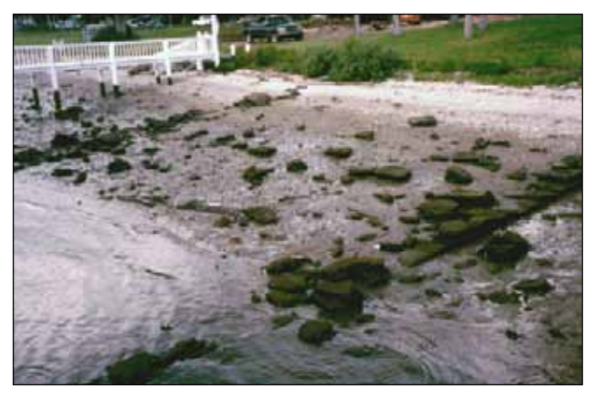
Fig. 2: Remains of the eighteenth-century wharf at low tide.

the canal system and the King's Road were done in the 1990's (Griffin and Steinbach 1990; Adams et al. 1997). A local museum displayed a few artifacts found by local collectors, but those individuals never revealed or even recorded the locations of their site-damaging activities, effectively consigning the remaining evidence of the eighteenth-century colony of New Smyrna Beach to the realm of mystery.