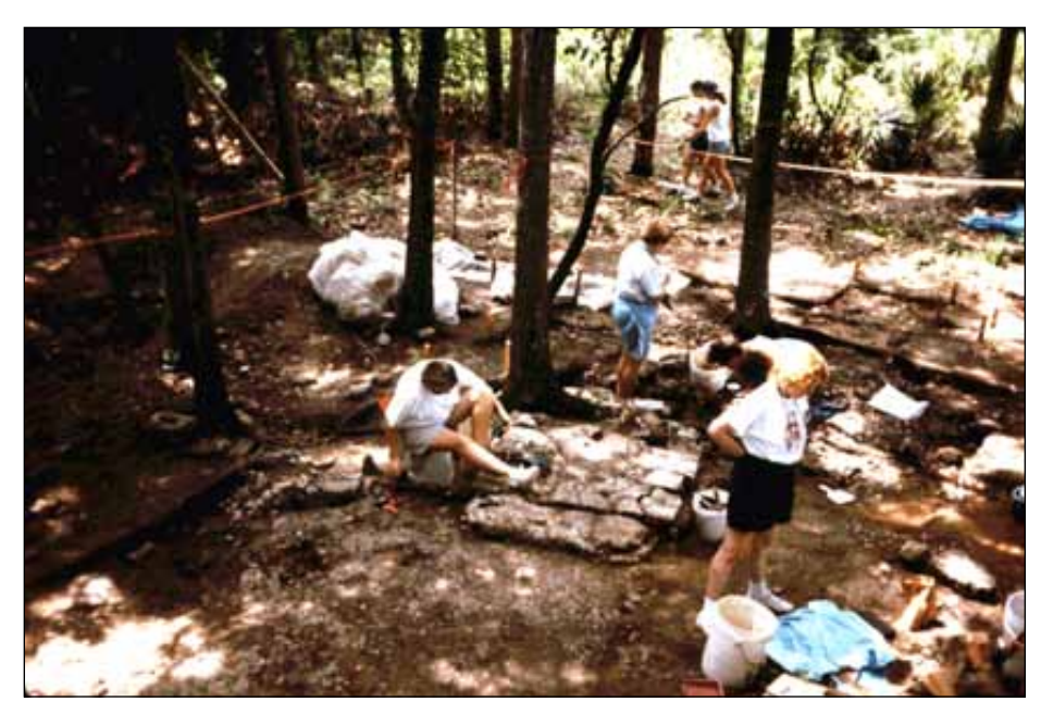
Fig. 3: Volunteers excavating the First Colonists' House.