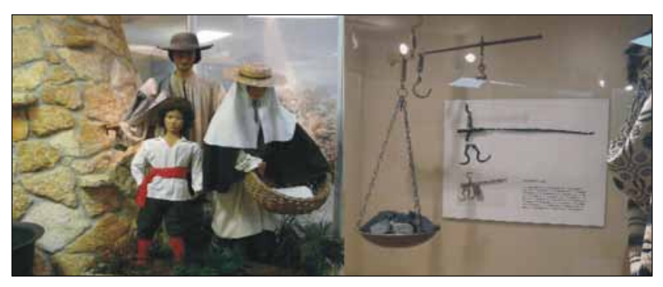
Fig. 6: Examples of museum exhibits: left) Minorcan traditional dress; right) steel-yard scale excavated from a Smyrnea indigo works with a modern scale and indigo-decorated clath